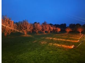
BREEZE HILL FARM