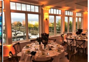
PECONIC BAY YACHT CLUB