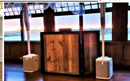
MAIDSTONE GOLF CLUB EAST HAMPTON

Follow Us @EastEndEntertainmentNY Instagram & Facebook