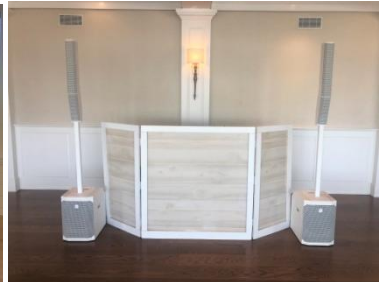
PECONIC BAY YACHT CLUB