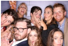
COLOR - DRIFTWOOD WHITE - B&W