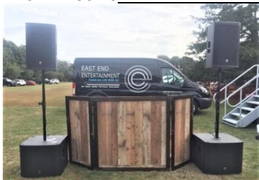
GREAT LAWN WESTHAMPTON BCH