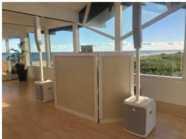
BRIDGEHAMPTON T. & S. CLUB