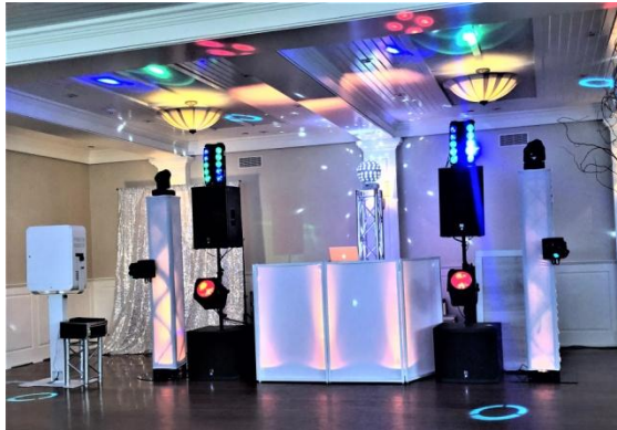
PECONIC BAY YACHT CLUB