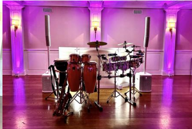
PECONIC BAY YACHT CLUB DJ HYBRID W/ PERCUSSION | 4 WHITE & 3 LAVENDER UPLIGHTS