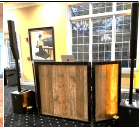
ENCORE ATLANTIC SHORES

Follow Us @EastEndEntertainmentNY Instagram & Facebook