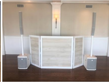
PECONIC BAY YACHT CLUB