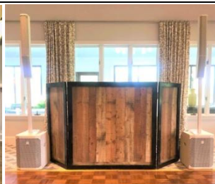
NORTH FORK CC