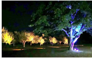
BREEZE HILL FARM