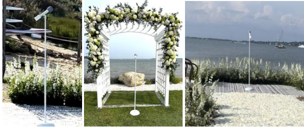
NEW WHITE OPTION – MIC, STAND & SPEAKER(S)