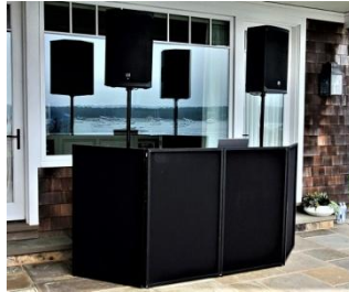
EAST HAMPTON HOME TRADITIONAL SPEAKER