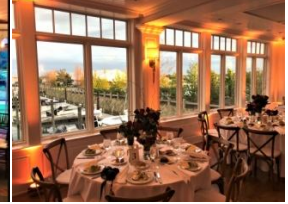
PECONIC BAY YACHT CLUB