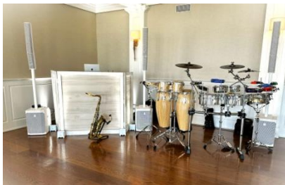
DJ HYBRID W/ SAX & PERCUSSION 3 WHITE DÉCOR SPEAKERS