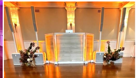
4 DÉCOR SPEAKERS WITH 7-9 UPLIGHTS