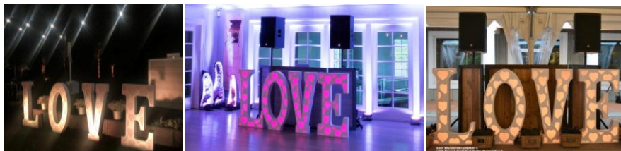
CLUBHOUSE HAMPTONS | SPARKLING POINTE | PELLEGRINI VINEYARDS

4 HOUR ZAP SHOT PHOTOGRAPHER WILL CAPTURE 100-250+ CANDID STILL FRAMES $ 975