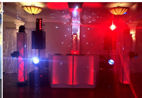
PECONIC BAY YACHT CLUB