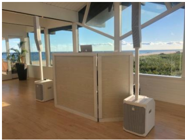
BRIDGEHAMPTON T. & S. CLUB