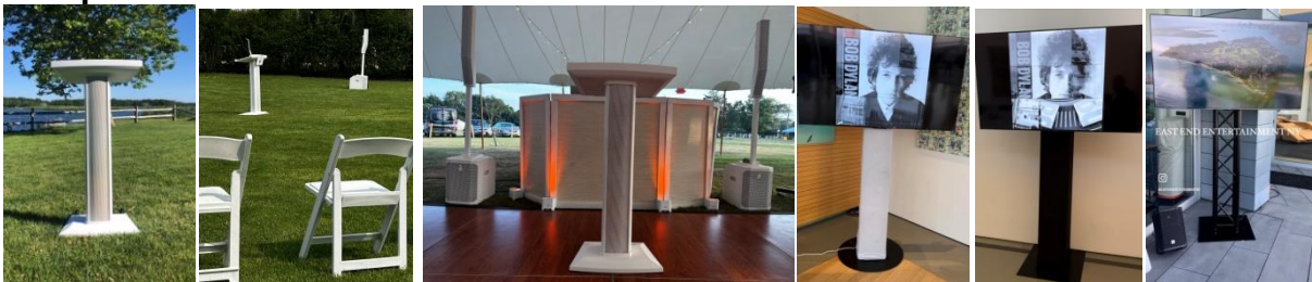
SOUTHAMPTON | WESTHAMPTON CC | WESTHAMPTON GREAT LAWN | THE BRIDGE GOLF CLUB

WHITE PODIUM/LECTERN (SEE PHOTOS ABOVE) _____ $ 275EA