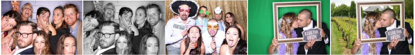
COLOR - DRIFTWOOD WHITE - B&W | SHIMMERY GOLD | GREEN SCREEN EFFECT