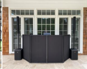
AMAGANSETT RESIDENCE (+250 DÉCOR SPKRS)